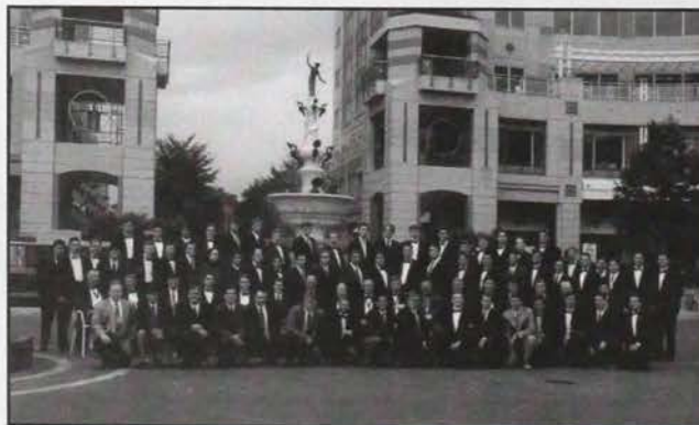
83RD NATIONAL CONVENTION OF KAPPA DELTA RHO