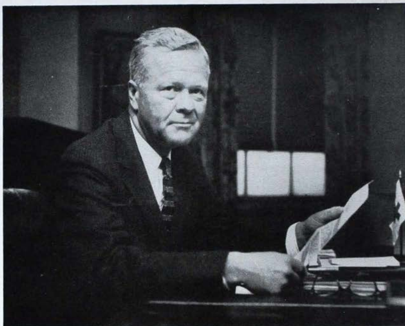
Bob Noble Photo—N. Y. Herald Tribune