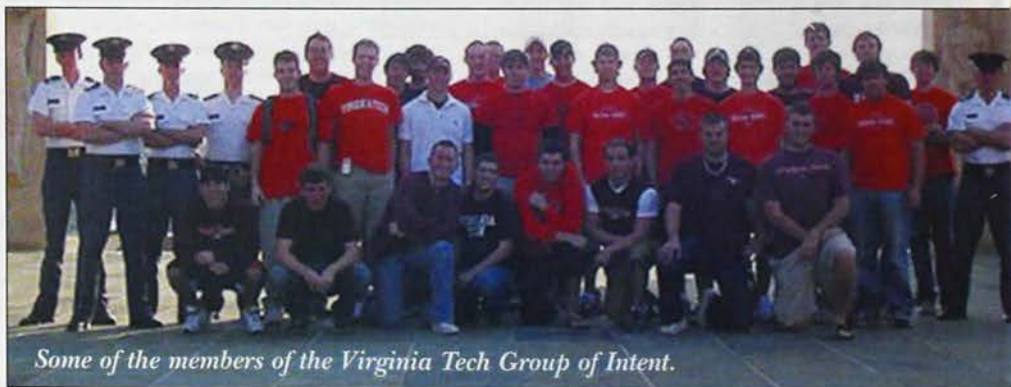
Some of the members of the Virginia Tech Group of Intent.