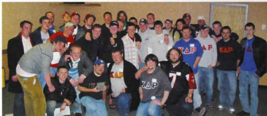
Southern Conclave - February 4

Pi Alpha Chapter at University of Toledo in Toledo, OH, hosted Brothers from the Epsilon, Theta, Nu, Alpha Gamma, and Eta chapters.