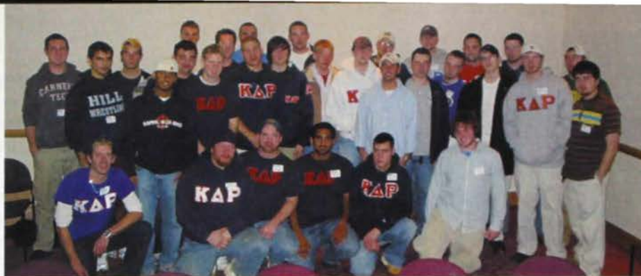
Central Conclave - January 21

Iota Alpha Chapter at University of Pittsburgh, Johnstown in Johnstown, PA, hosted Brothers from the Phi Alpha, Tau, Kappa Beta, and Eta Alpha chapters.