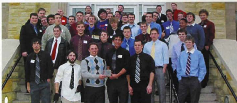
Midwest Conclave - January 28

Iota Alpha Chapter at University of Pittsburgh, Johnstown in Johnstown, PA, hosted Brothers from the Phi Alpha, Tau, Kappa Beta, and Eta Alpha chapters.