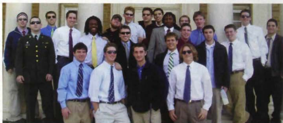
Northeastern Conclave - February 18

Tau Alpha Chapter at Radford University in Radford, VA, hosted Brothers from the Sigma Beta, Phi Beta, CNU Provisional, Epsilon Beta, and Omega Beta chapters.