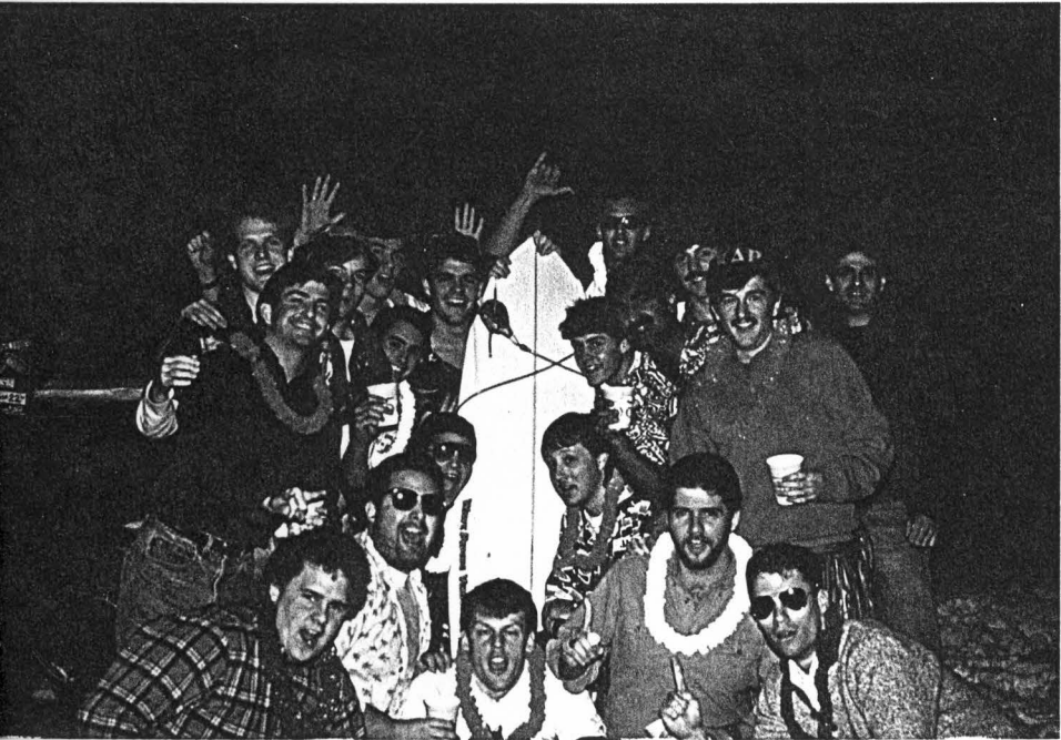
"How Low Can You Go?"