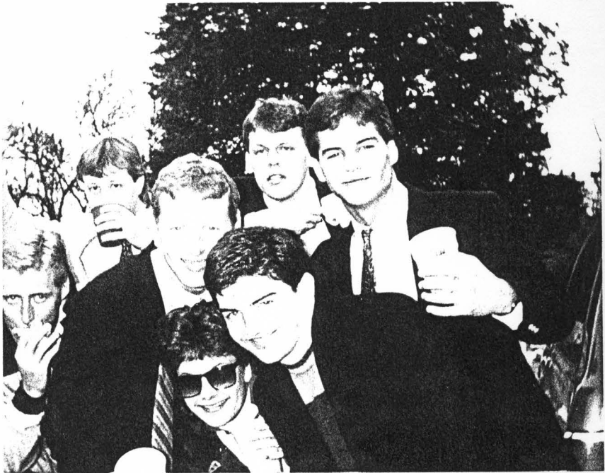
Spring Rush 1987