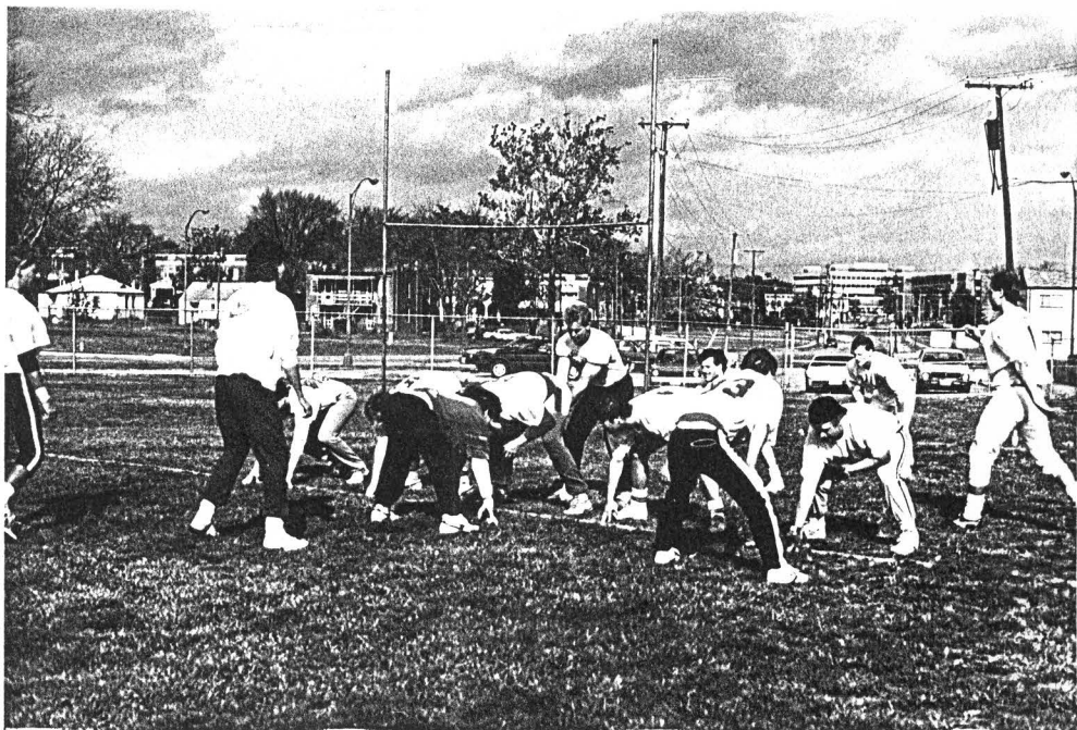
Intramural Football 1986