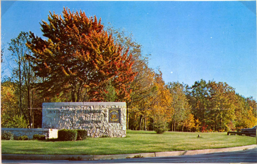
ENTRANCE TO UPJ